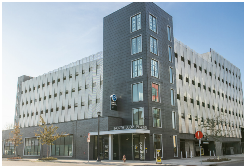
Adjacent, Secure Parking Ramp